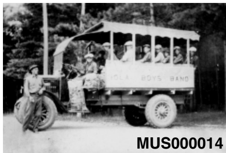
Top photo is of the first bus used to transport the band on their tours. This is the bus illustrated in the pamphlets held by IHS. There appear to be side curtains which could be lowered in case of inclement weather. The second bus (lower photo) was built on a newer vehicle chassis. Both busses were lettered "Iola Boys Band."