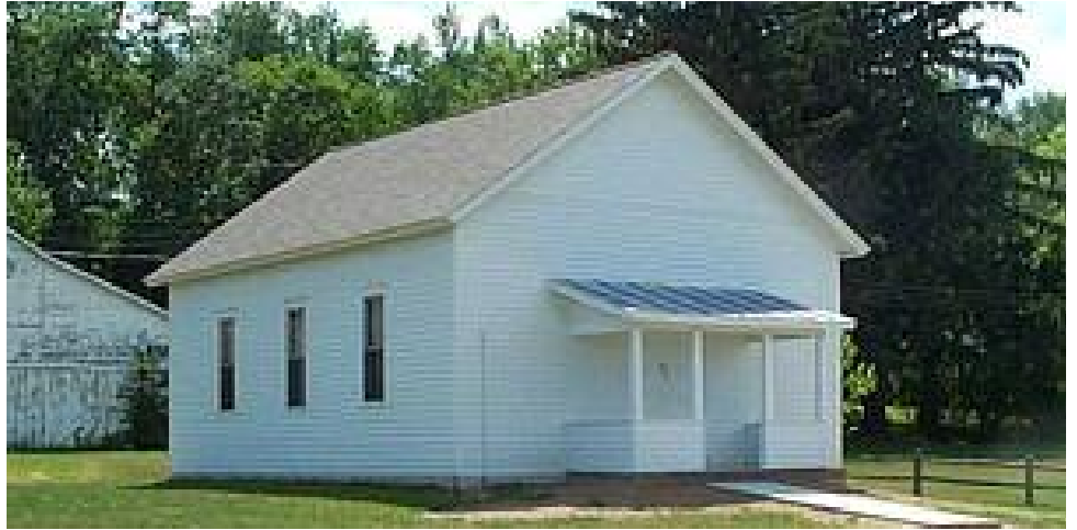
The Helvetia Town Hall as it appears today at our Historical Village

by Robert Strand Part III: Helvetia Town Hall