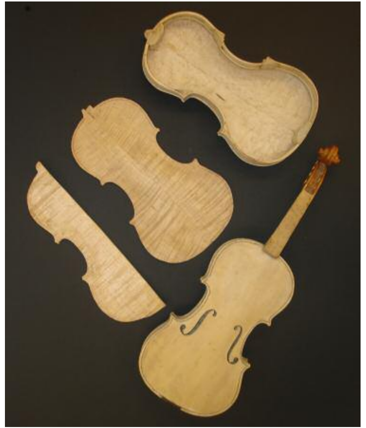
Shown are just a few of the many violin artifacts that were recently donated to our museum by Maynard Stromberg.