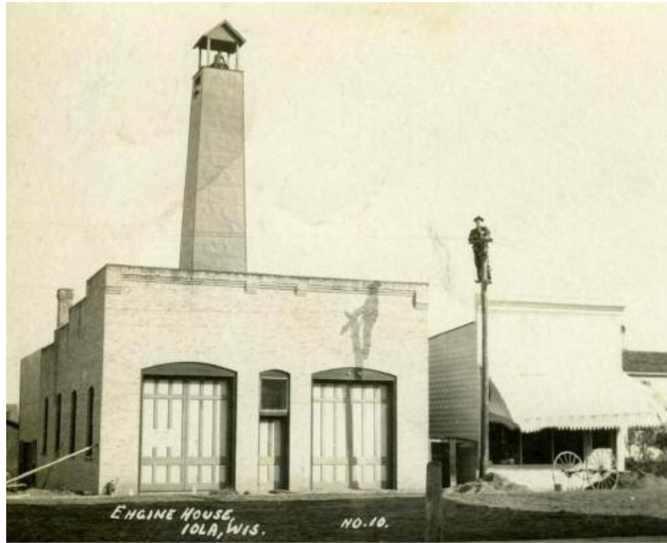
This photo shows the "engine house" of the Iola Fire Department (left) as built in 1900, to the right which stands the wood frame firehouse which it succeeded, originally a schoolhouse that moved to the site 1895.

In 1895 the frame school house, depicted in the newly discovered photo, was moved to its second location across the street from the Iola House, a rooming house located at 190 E. State Street, to be used as a fire station. This newly discovered photograph shows it was moved just across the street from the rooming house. The photograph perspective is looking west on State Street. The building was located