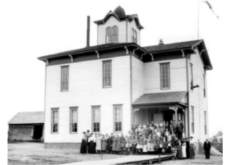
Photo of subsequently altered school structure.