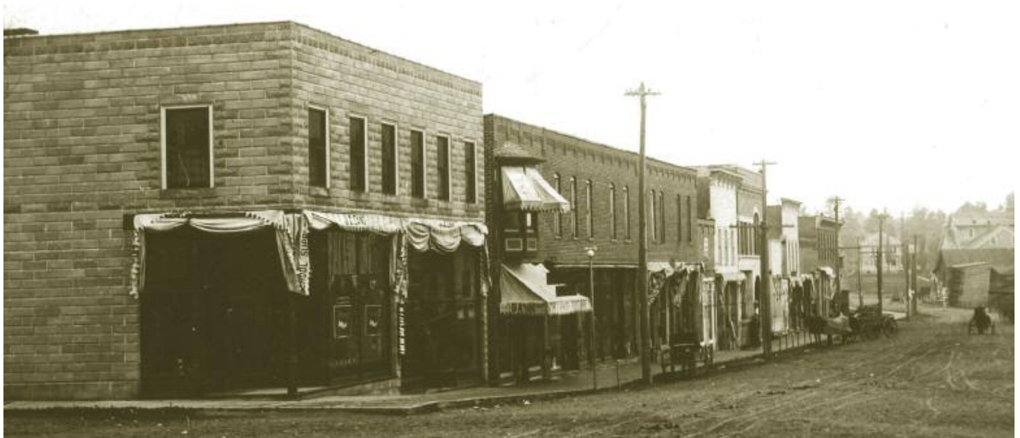
STR000173 Medical Building/Greystone Building, circa 1909: The Greystone Building is the first building on the left in this picture. Note that the front panel of the awning is imprinted "J. C. LANG" (see enlargement), while the left side panel is imprinted "SCHOOL SUPPLES." On the other side panel, the word "TOILET" is legible, but only parts of the other words are readable.