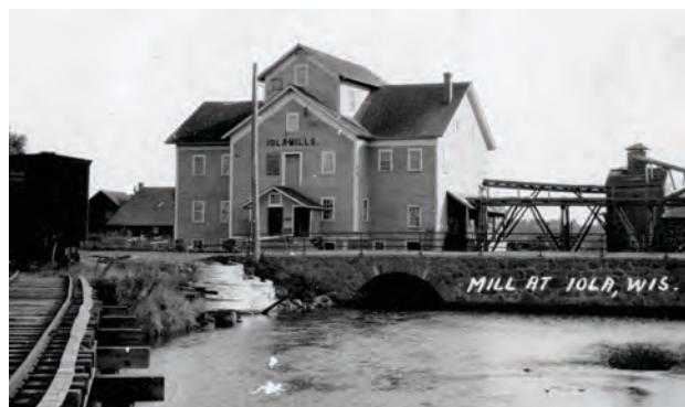
A boxcar spotted at the Iola Mills by the Iola & Northern Railroad rests upon the tracked trestle crossing the South Branch of the Little Wolf River that was installed in September 1899. The tracks and trestle have long since been removed.

July 3, 1902: Another old landmark is disappearing. The old steam shingle mill, known for years by the title “The Steam Mill,” is being torn down.