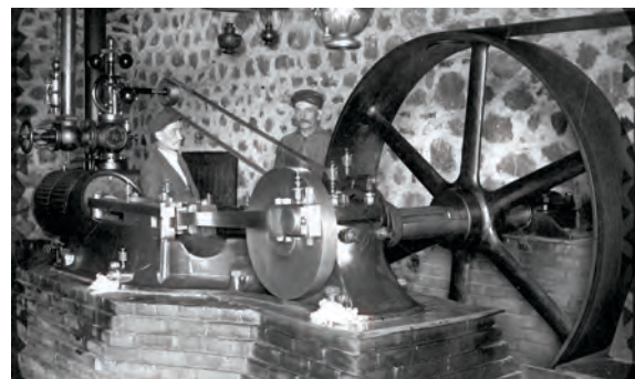
This 60-horse-power steam engine acquired from Frogner Bros., installed at the Iola Mills in late 1898, providing power for their grist and sawmills, was housed in a stone engine house built between the two mills. The walls of this structure still stand between the mill and the dam.

May 10, 1900: The Wipf company shipped three carloads of ship timber last Saturday.